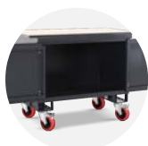
Mobile TuffBench MBH12

Disclaimer: all dimensions and weights are approximate