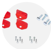
TrekDror Mount Kit TKDMPK