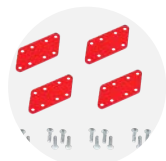
TrekDror Stack Kit TKDSPK