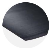
TrekDror Mat TKD2-RM