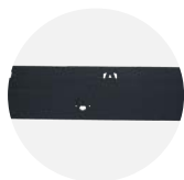
TrekDror Divider TKD2D