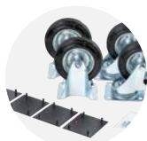
Castor Kit CASS1

Disclaimer: all dimensions and weights are approximate