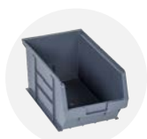
Fittings bins FCB